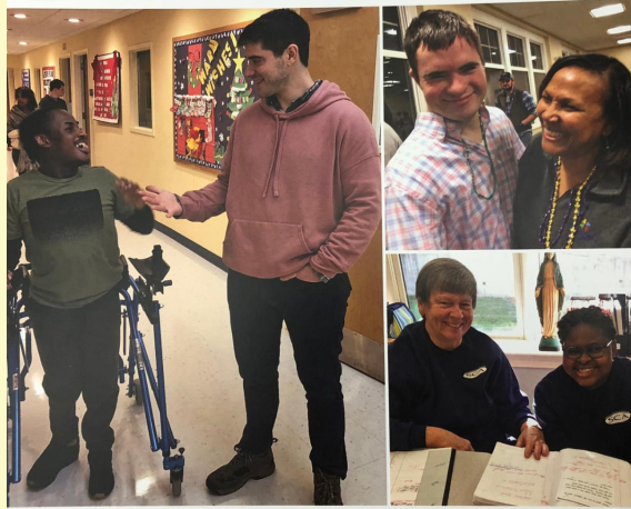
COMPANIONS ON A JOURNEY